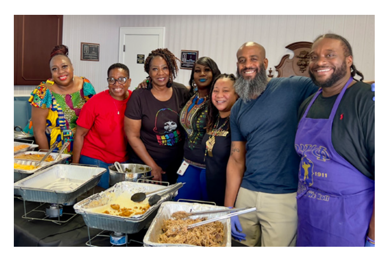
Team members celebrate Heritage Day during Black History Month

Tributes received between October 1 and December 31, 2023