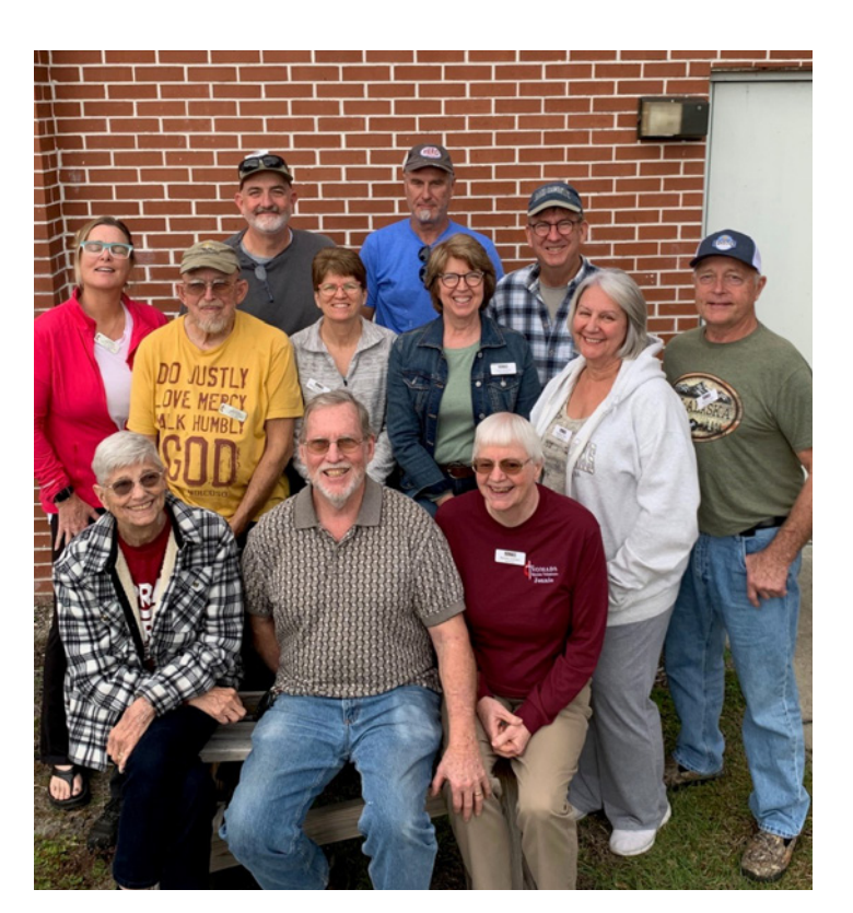
Another awesome group of NOMAD volunteers