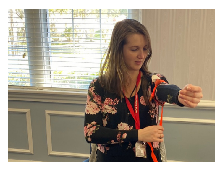
One of our team members learning how to Stop The Bleed