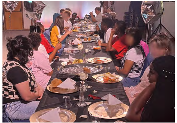
Our Spiritual Life team hosting the children for World Communion Sunday