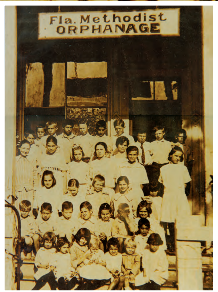
Original building on Enterprise campus

The philosophy of child care began to change noticeably during the 1940's and 1950's. It was becoming evident that the children in care needed more than just three meals a day, a safe place to sleep and basic care. The emotional and psychological needs of the children required a higher level of clinical care. In 1955, the first two cottages were built on the Enterprise campus. Prior to this time, boys and girls lived in dormitory style buildings. The move to a cottage based form of care