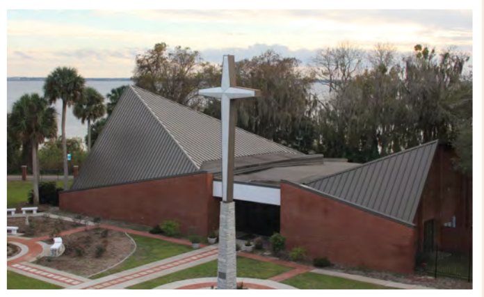
Current view of the Chapel on Enterprise campus

Our range of services go beyond residential and foster care, and now include counseling. In 2019 the Children's Home acquired Circle Of Friends Services, a nonprofit community health provider offering trauma-focused services to children and families in the