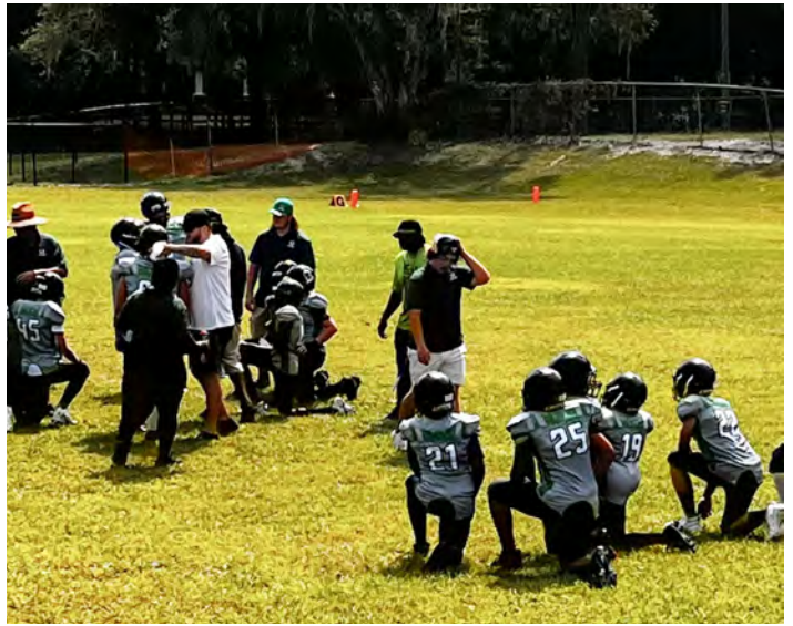
Six of our boys playing football in the West Volusia Little Hatters league