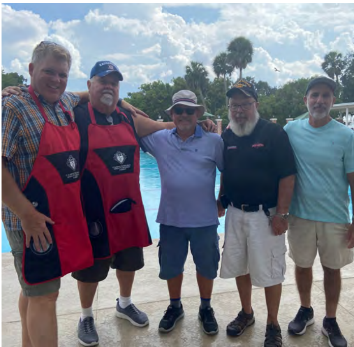
Knights of Columbus from Saint Ann Catholic Church hosting a poolside cookout for the children