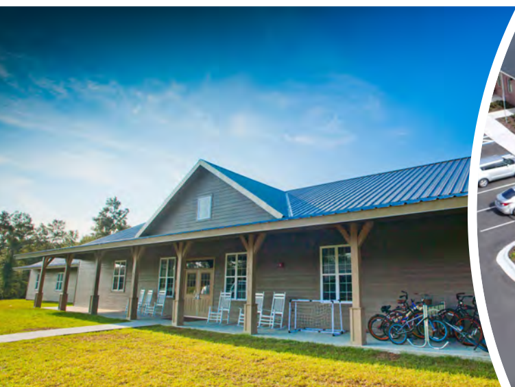
Featured bottom, right: Lamar Louise Curry Early Education Development Center