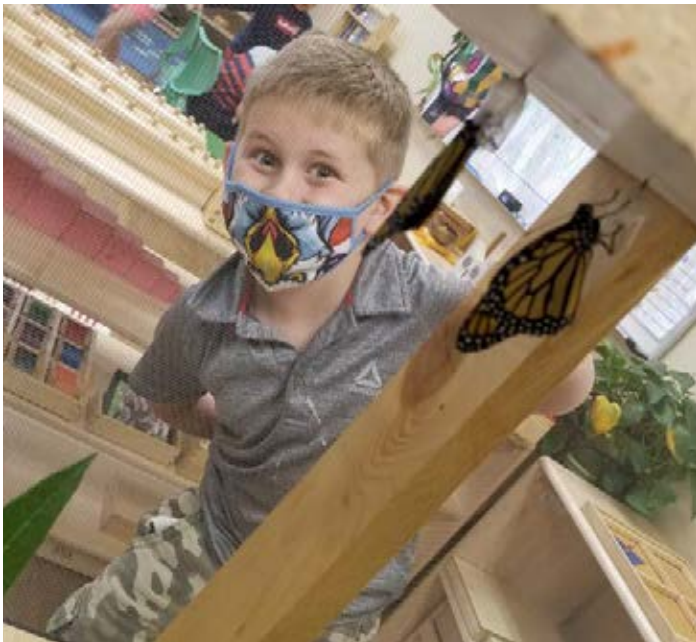
Children learn about the butterfly life cycle at In As Much