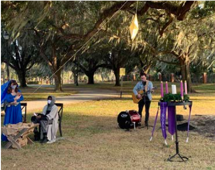
Our Spiritual Life team holding Christmas worship outside