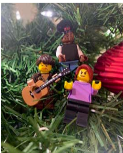
Our Spiritual Life Team in LEGO form.

The past year has been unique for all pastors, churches, and people of faith as we sought new ways to gather, worship, and serve. Many of those new ways of being together have revolved around our individual households. It is a great joy to be part of a household as big as the Florida United Methodist Children's Home. We have many children living together on both campuses and that made our circumstances for gathering together unique.