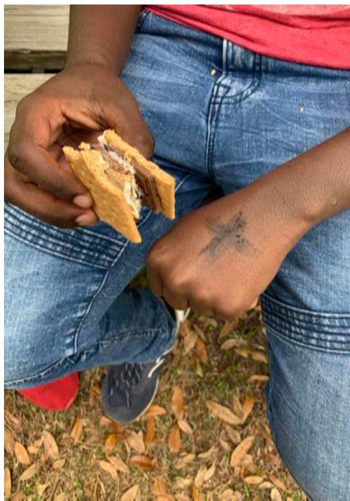
Our youth received ashes, then made s'mores