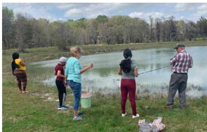
Children from Madison Youth Ranch out for a day of fishing