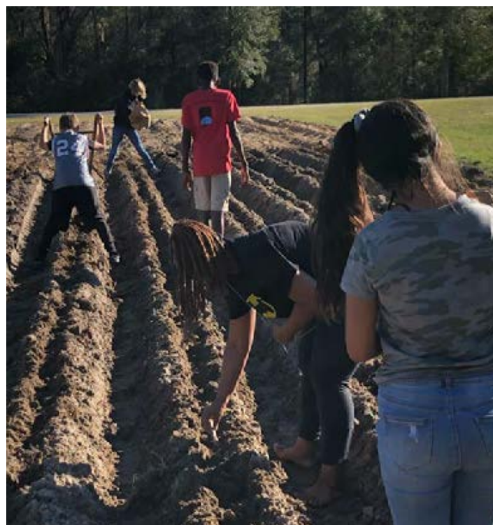
Everyone pitches in to plant the garden at Madison Youth Ranch