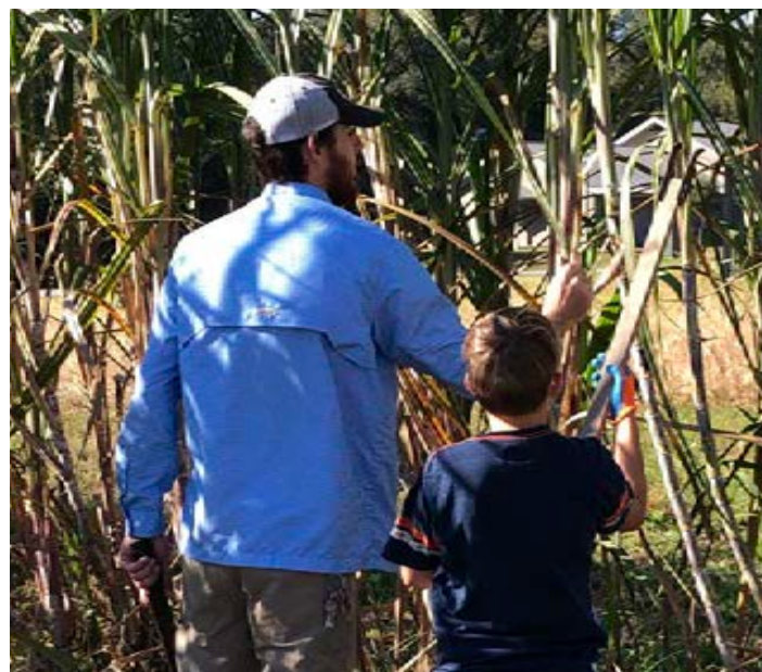
Harvesting sugar cane to create cane syrup