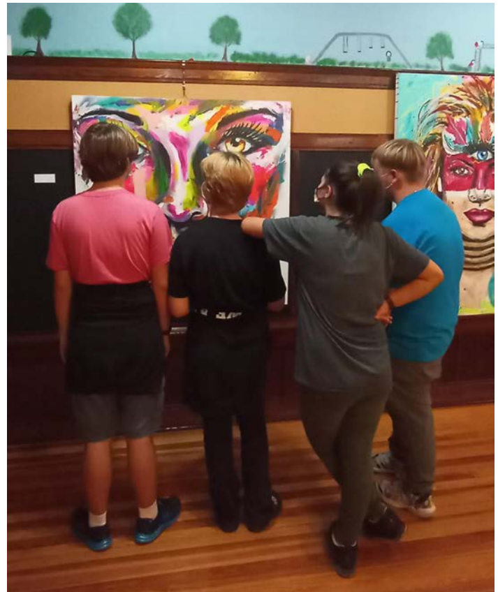
Studying an art exhibit at a local museum