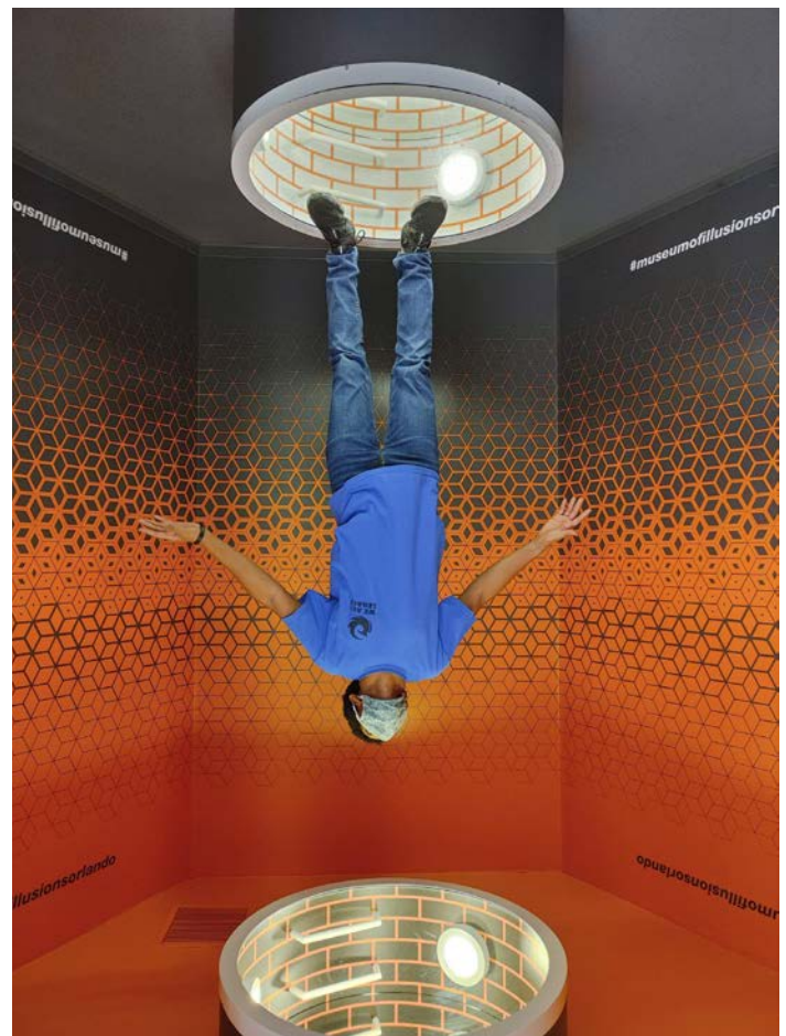
Having fun at the Museum of Illusions