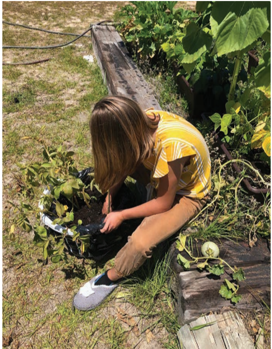
Tending to the garden at Madison Youth Ranch