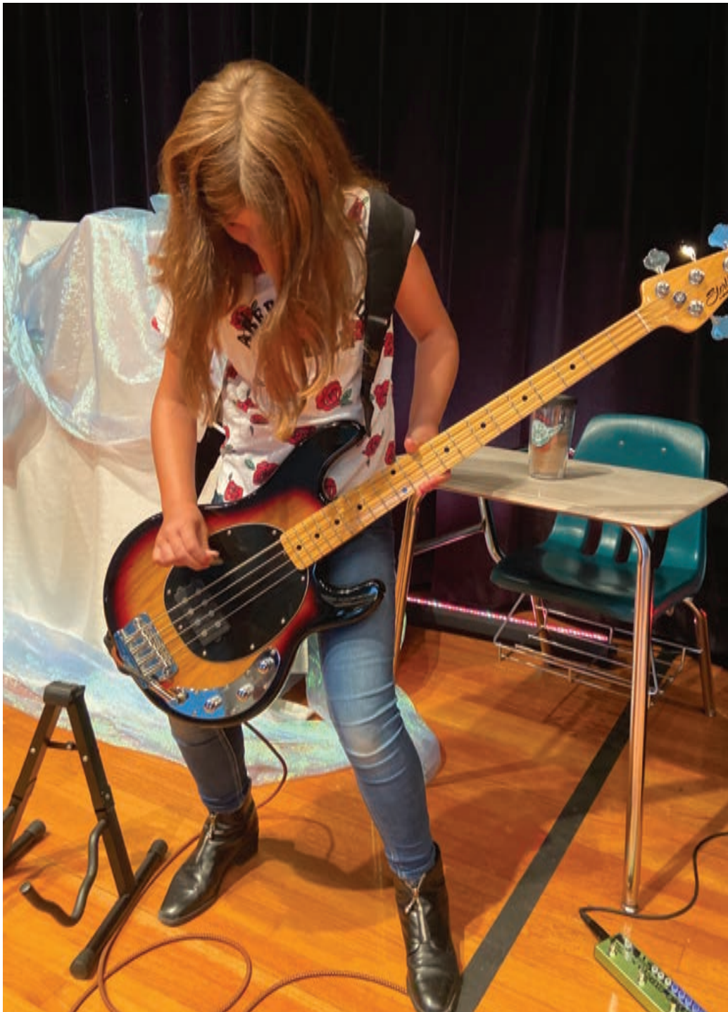
One of our young ladies practicing before a worship service