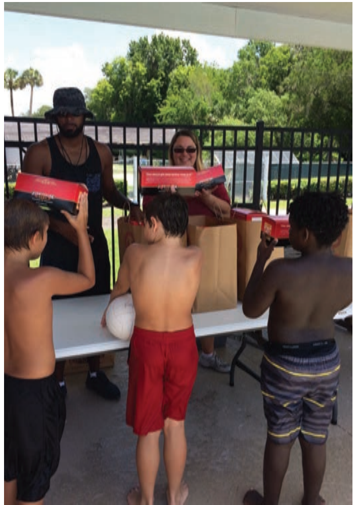
Poolside lunch to celebrate the end of the school year