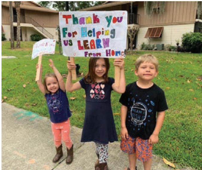
Some of our children greeting teachers on parade during COVID-19