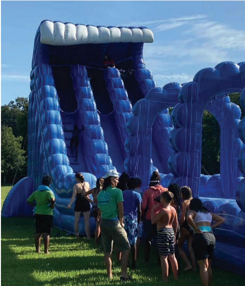
The giant water slide for summer camp