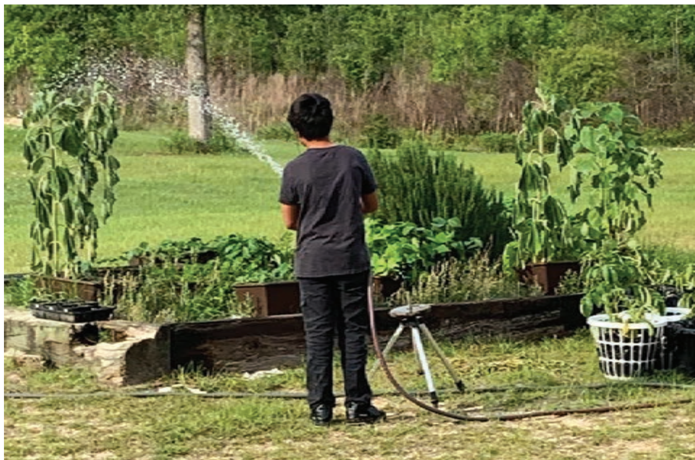
Keeping the garden watered at the Madison Youth Ranch