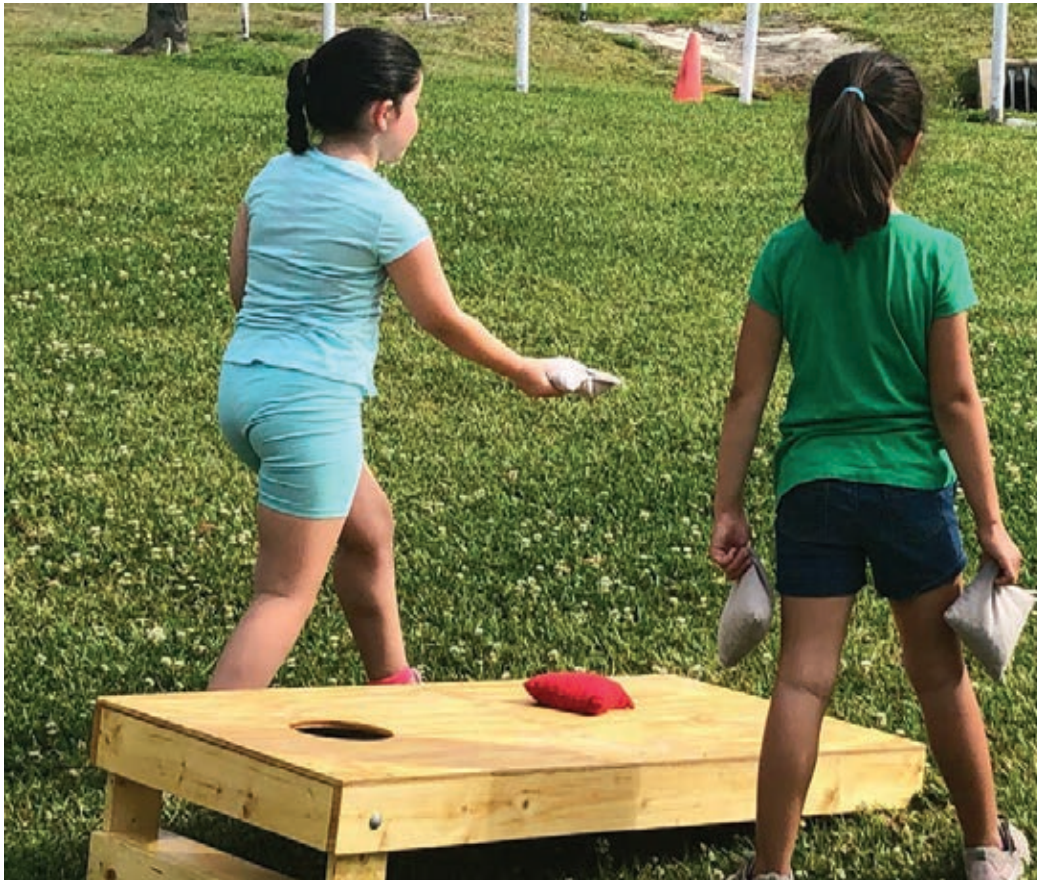
The children enjoying a game of cornhole

TRIBUTES RECEIVED BETWEEN JANUARY 1 AND MARCH 31, 2020