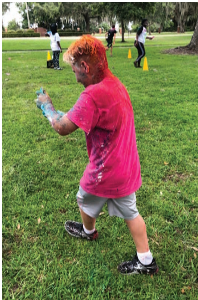
Messy day at summer camp