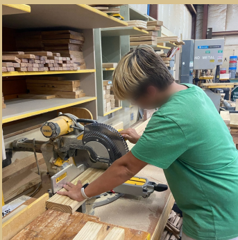
Teenagers learned valuable skills in our Carpentry Program