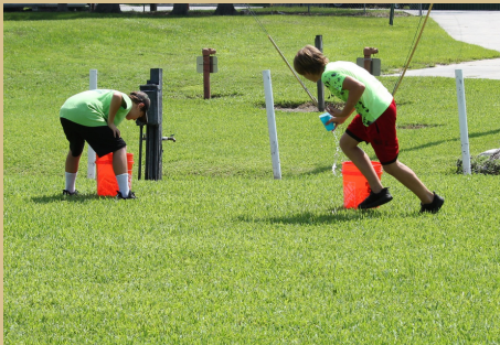
Youth received plenty of exercise with field games

As the summer starts to wind down and the youth start to prepare for school, we share a few highlights from our Summer Fun Program: