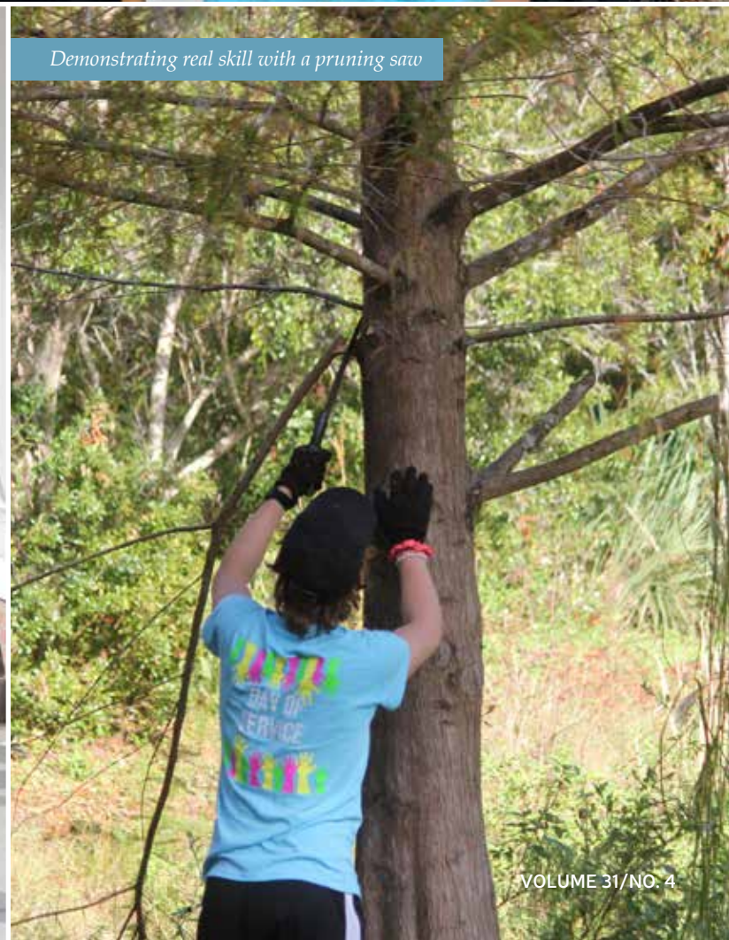
Demonstrating real skill with a pruning saw