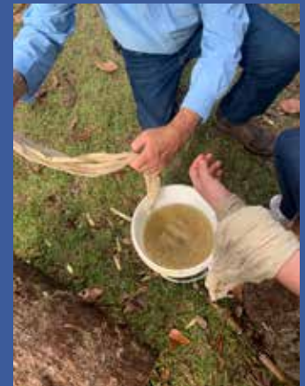
Juice is filtered to remove pieces of cane