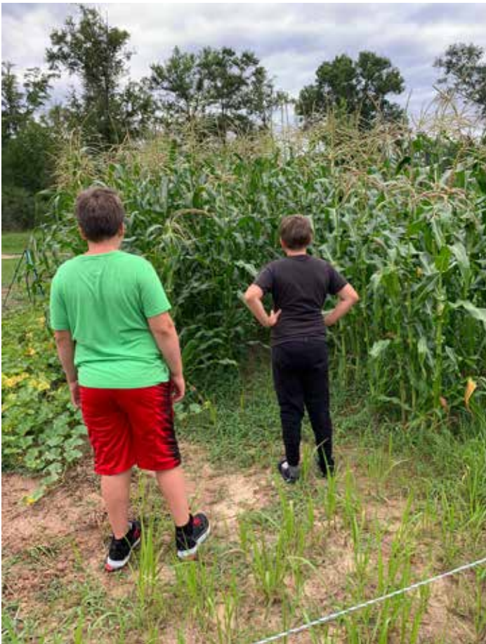
Youth at Madison Youth Ranch preparing to harvest their corn