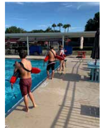
Some of our youth earning their lifeguard certification