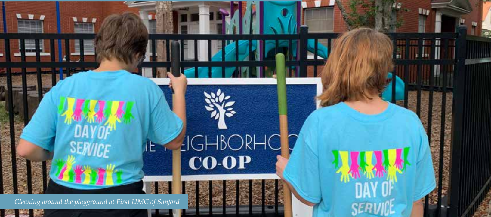
Cleaning around the playground at First UMC of Sanford