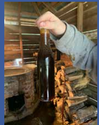
Bottled and ready for the breakfast table