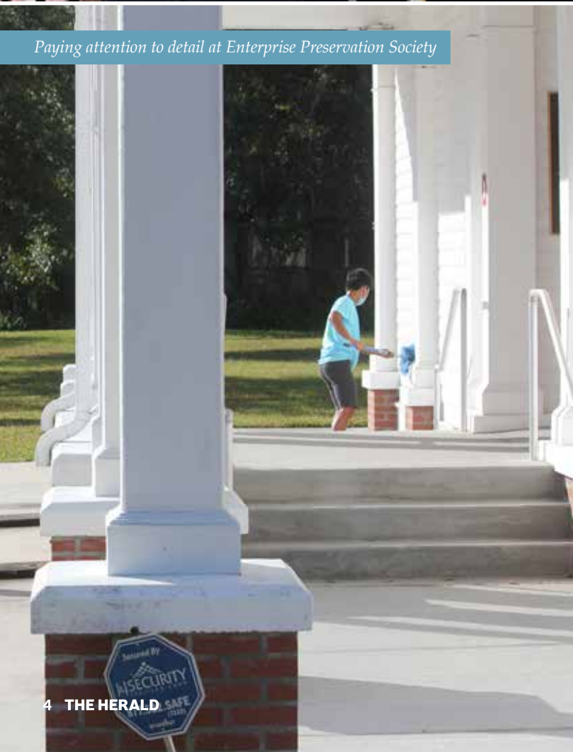
Paying attention to detail at Enterprise Preservation Society