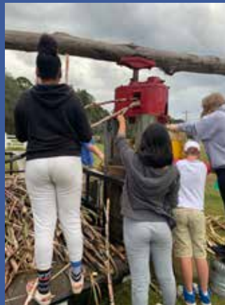
Juice is extracted