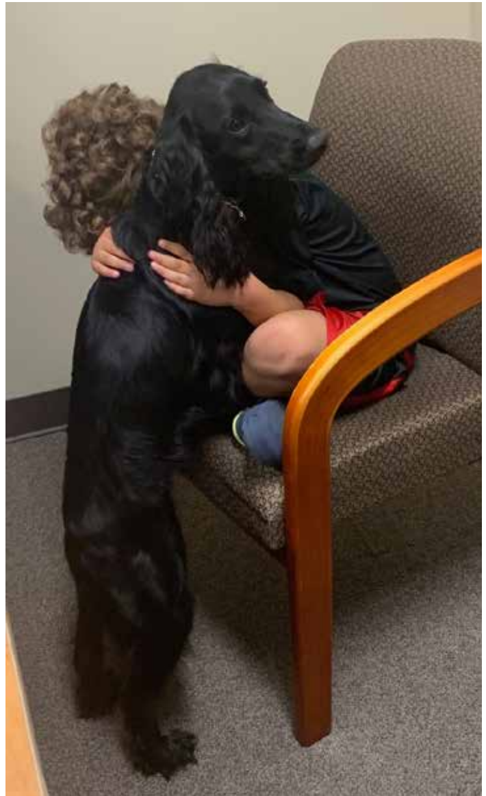
Wesley, Madison Youth Ranch therapy dog, comforting a child