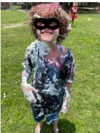
Messy day means fun at Camp Rona