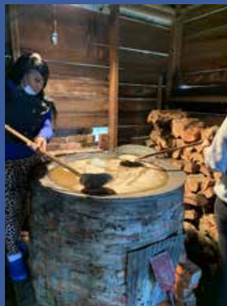
Stirring continually and removing impurities