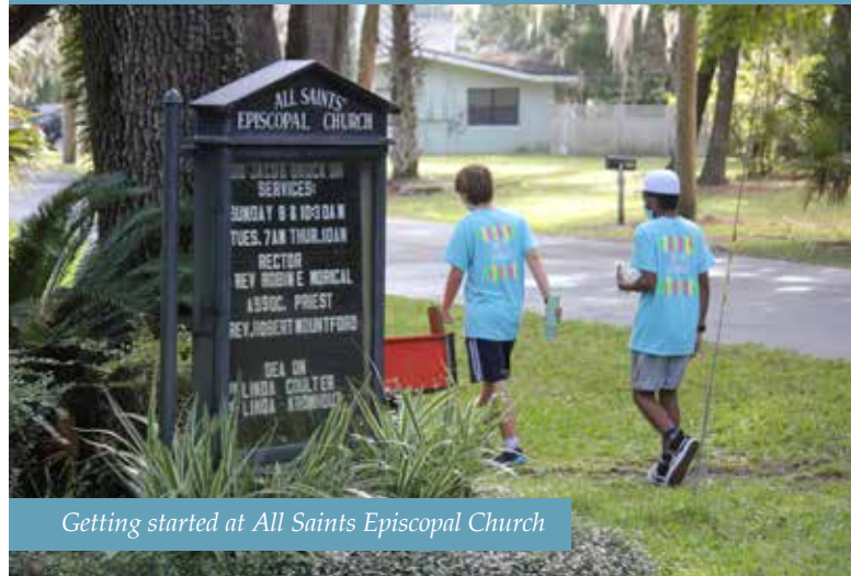
Getting started at All Saints Episcopal Church

The Children's Home would not have been able to successfully implement the Teaching Family Model (TFM) if not for the generous support of friends like Elizabeth Morse Genius Foundation, Margaret McCartney & R. Parks Williams Foundation, and The Darla Dee Turlington Charitable Foundation. In addition to these foundations there were others who preferred to remain anonymous in their support.