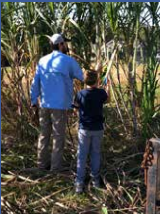
Sugar cane is grown as part of the garden

During the boiling process, the syrup is constantly stirred and additional impurities are removed. Then the finished product is bottled and ready for the breakfast table. The children really love the cane syrup on their pancakes and waffles in the morning. And they are very proud knowing that they made the syrup themselves.