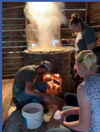
Of course, you need a good fire