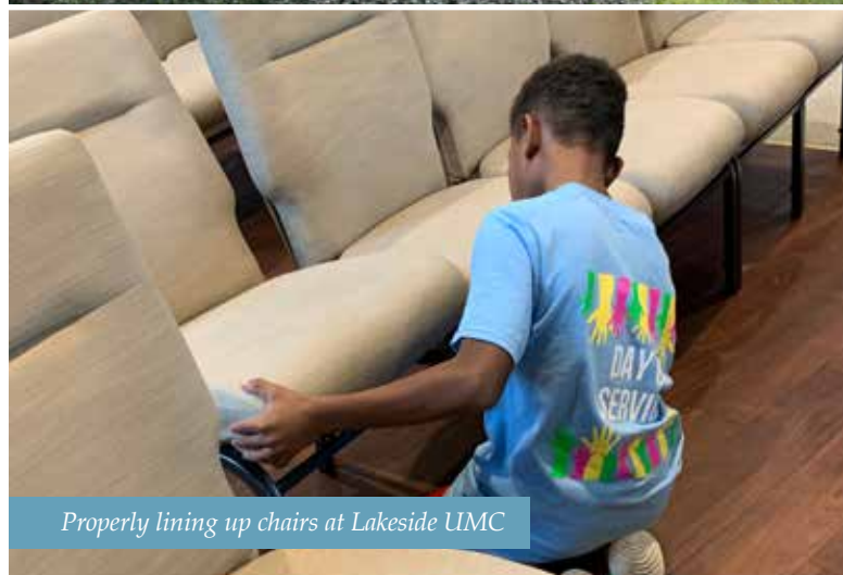
Properly lining up chairs at Lakeside UMC