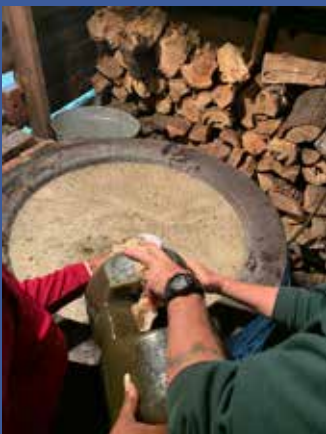
Filtered cane juice goes into a large heavy kettle