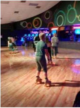
Youth enjoying an outing at the local skating rink