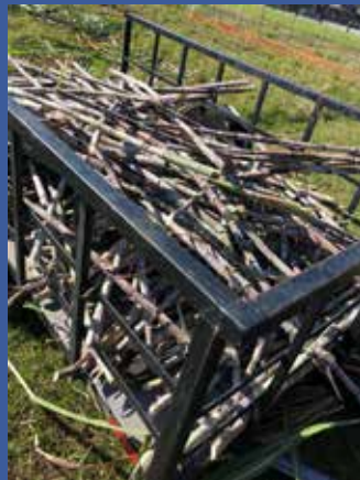
Canes are harvested and transported to the grinder