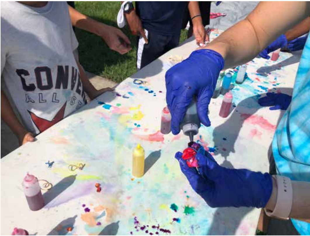
Making tie dye shirts during Camp Rona