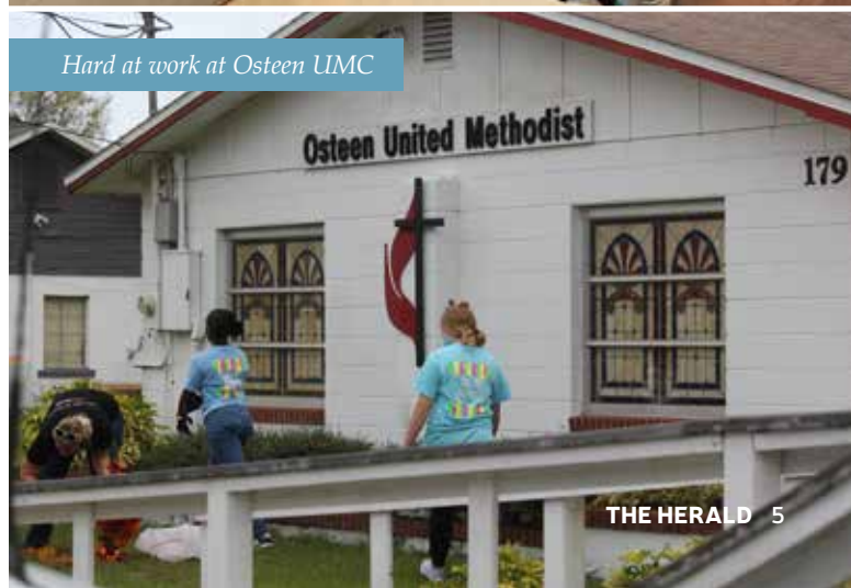
Hard at work at Osteen UMC