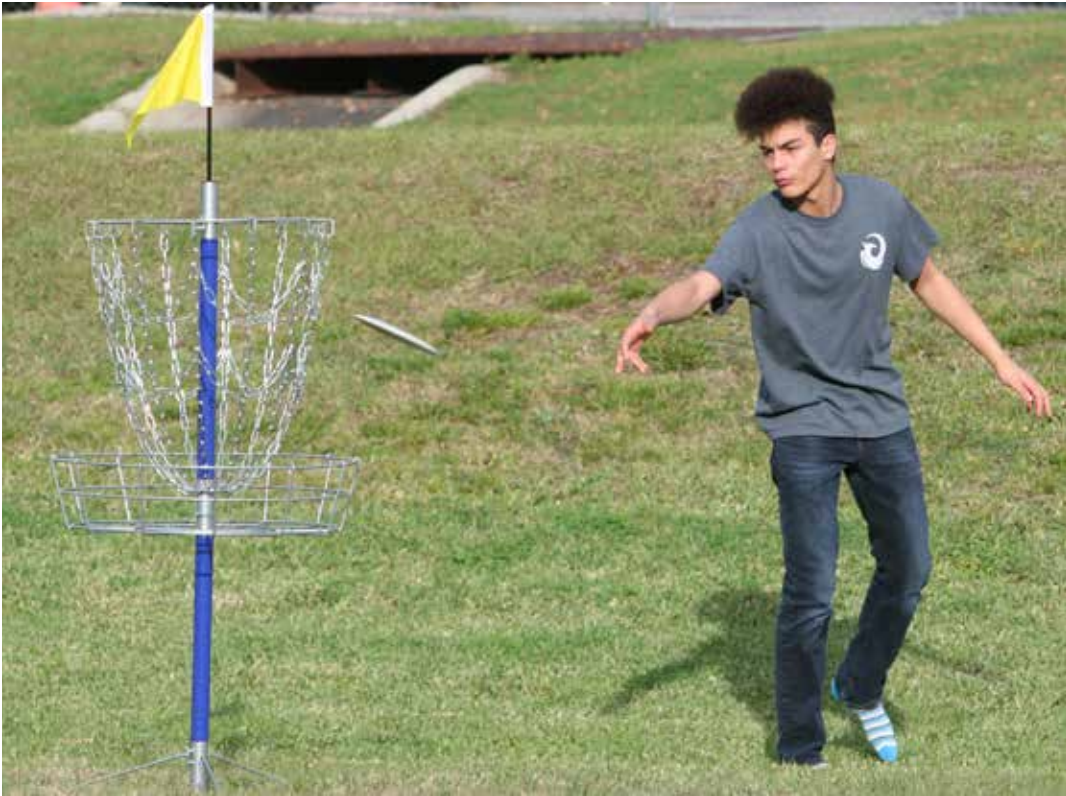
One of our youth playing disk golf