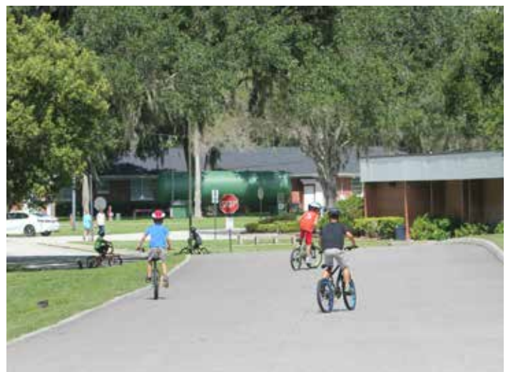
Children enjoying an afternoon bike ride