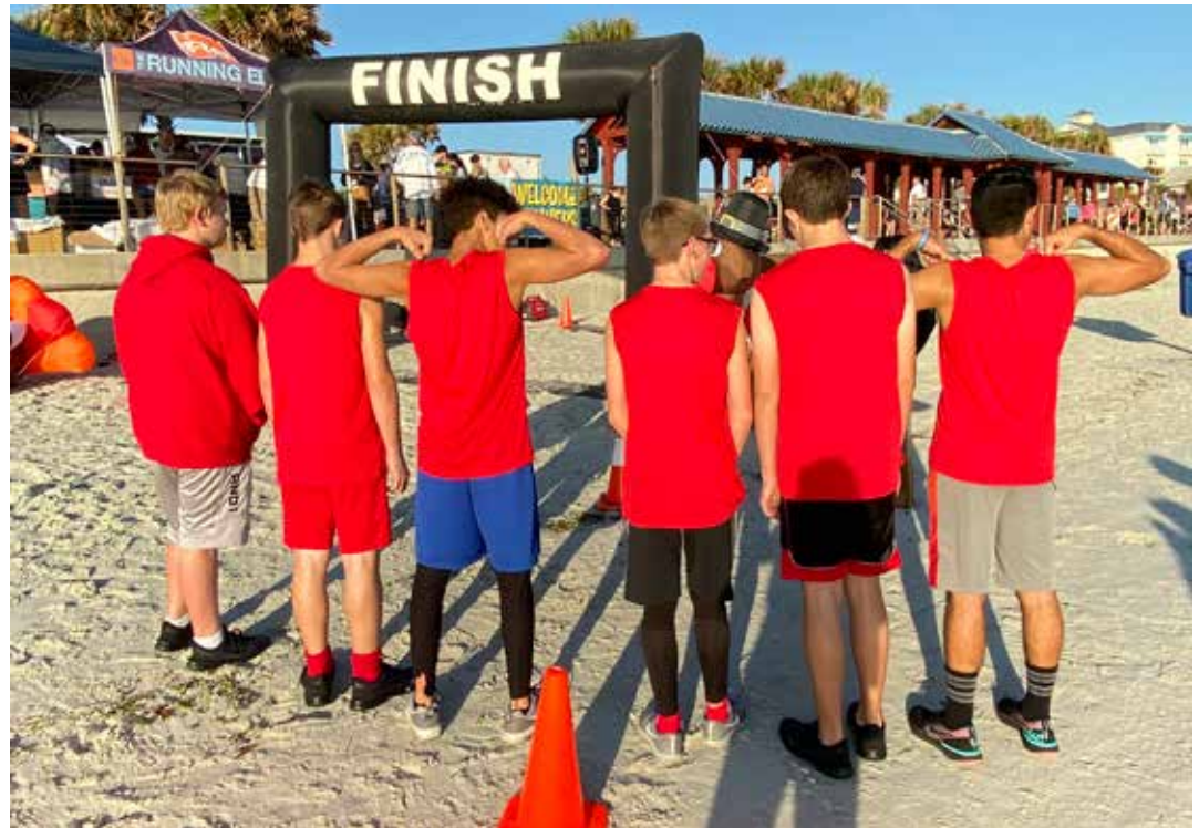
Boys in our running club preparing to run the New Smyrna Turkey Day 5k