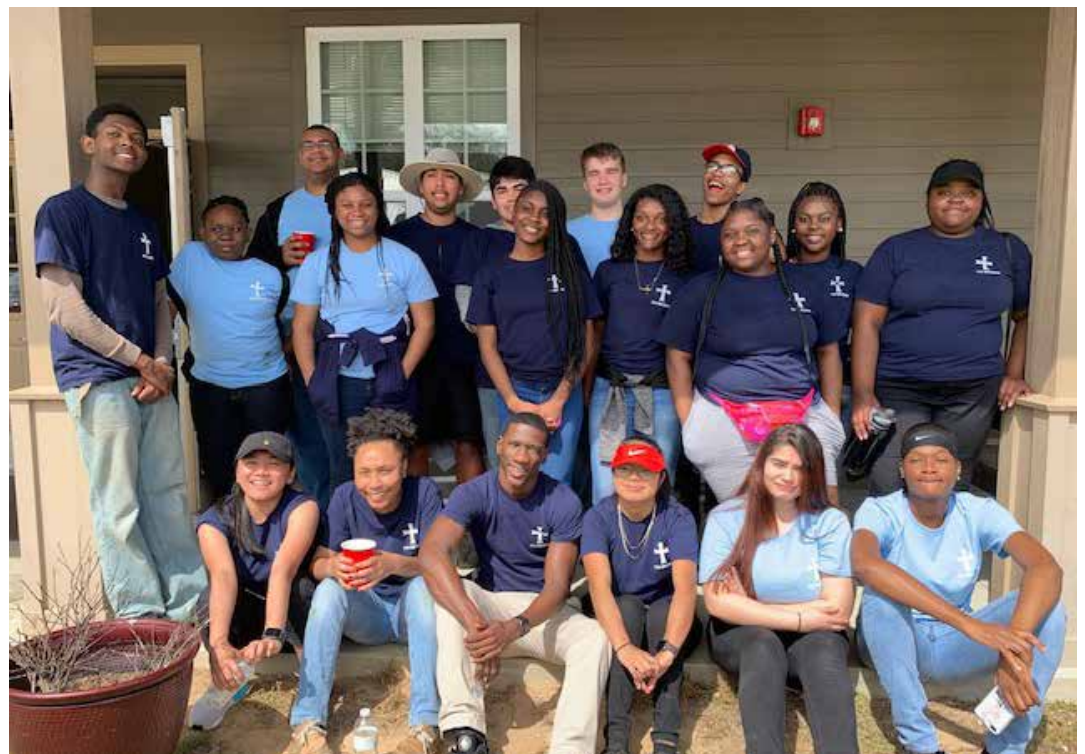
The Senior Class from Tallavona Christian School at our Madison Youth Ranch for a day of volunteer work.