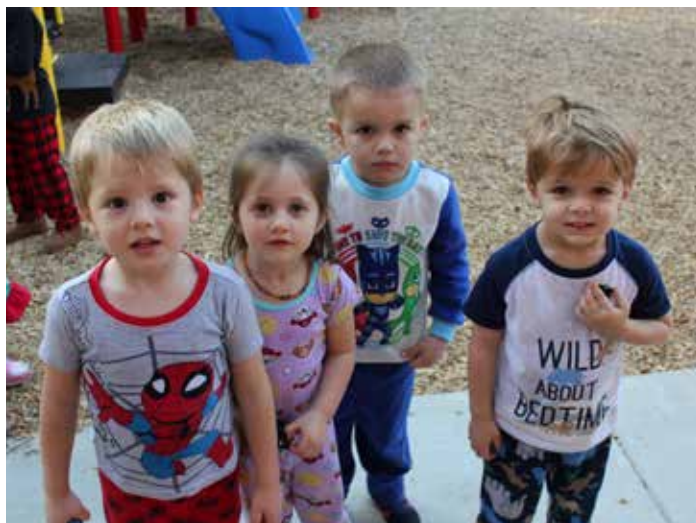
Pajama day at In As Much, our Montessori preschool