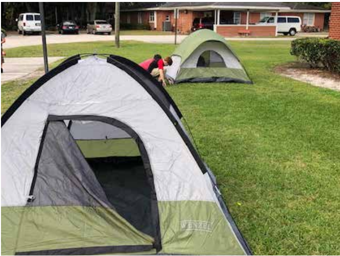
Youth practicing their tent set-up skills before camping