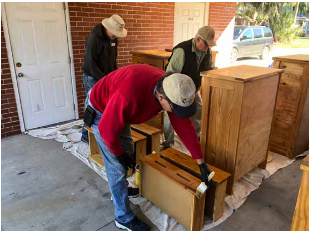
Nomads from the United Methodist Church refinishing cottage furniture