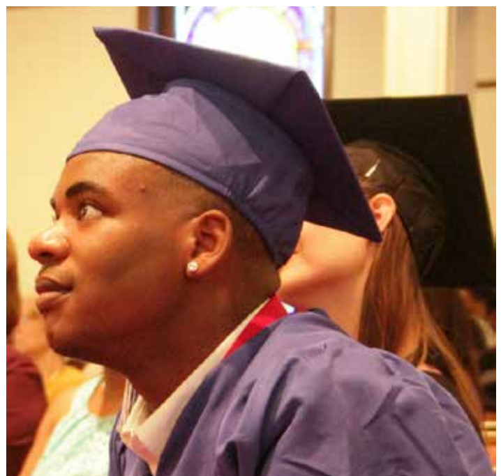
Youth have higher graduation rates under TFM

We are very proud of our team, from house parents to therapists, Spiritual Life, and the many other components that go into caring for the children. And you can be proud of the impact your support has had on the youth in our care. Their young lives are being turned around because of you.