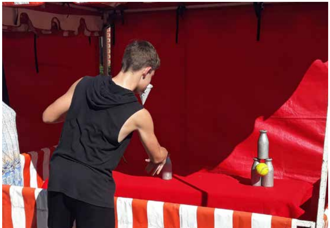
Softball toss game at our Fall Festival