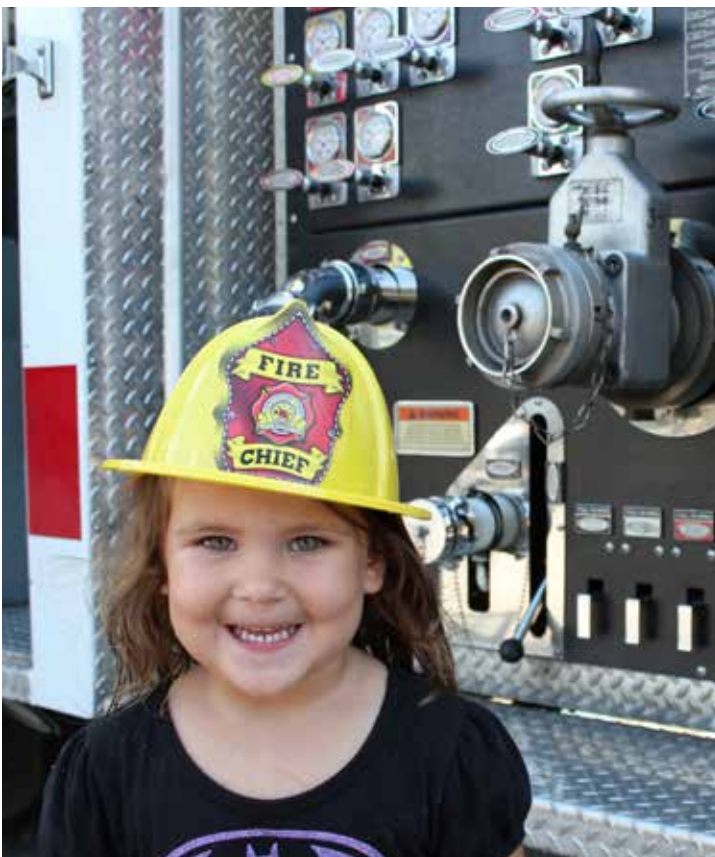
Safety Week at In As Much Montessori