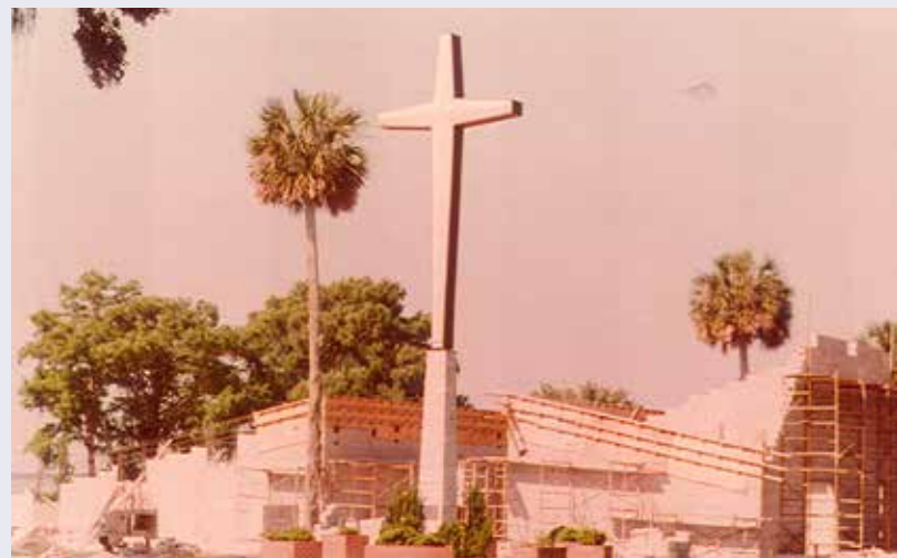
The chapel under construction in 1978

Another generous gift was provided by Bernie Simpkins, making it possible to update and upgrade the music suite. The renovation allowed us to make the music suite larger and more functional, while also updating the recording studio which is used in the production of videos and music programs. This gives the children an opportunity to learn about digital editing and recording through hands-on experience.