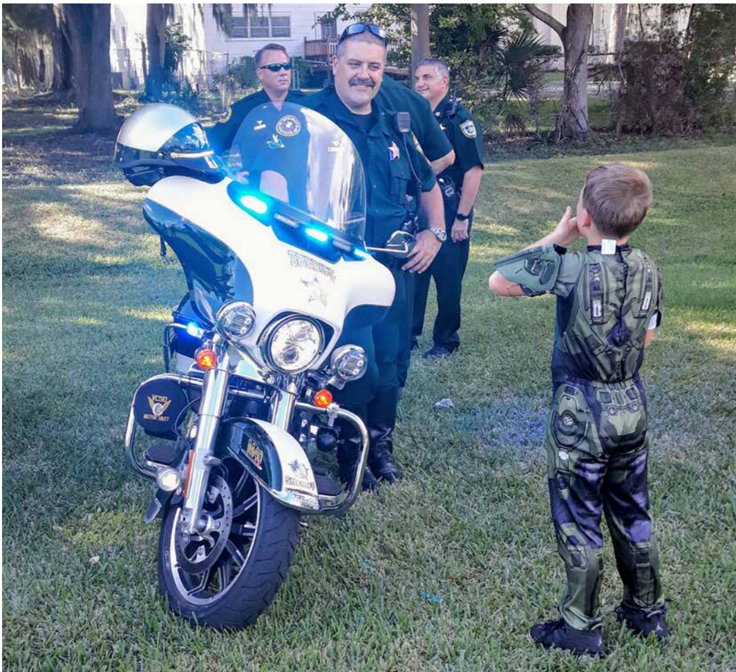
Volusia County Sheriff's Office showing off their lights