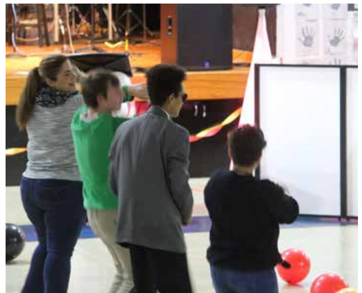
Homecoming dance action