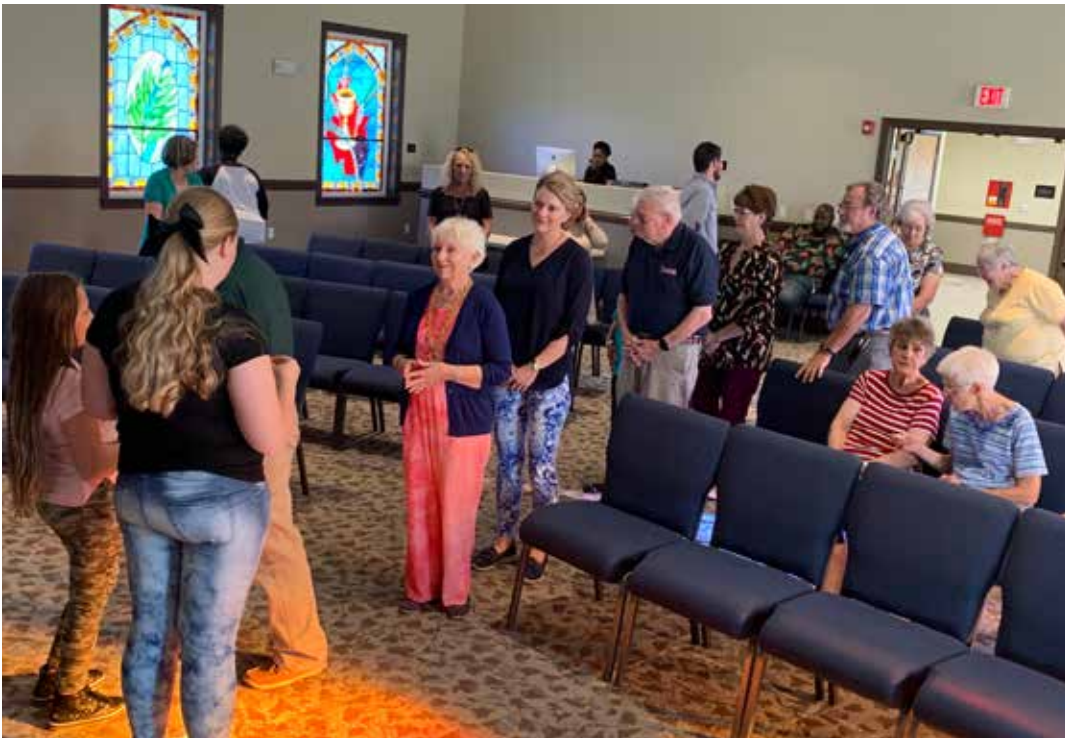
Community worship service at Madison Youth Ranch