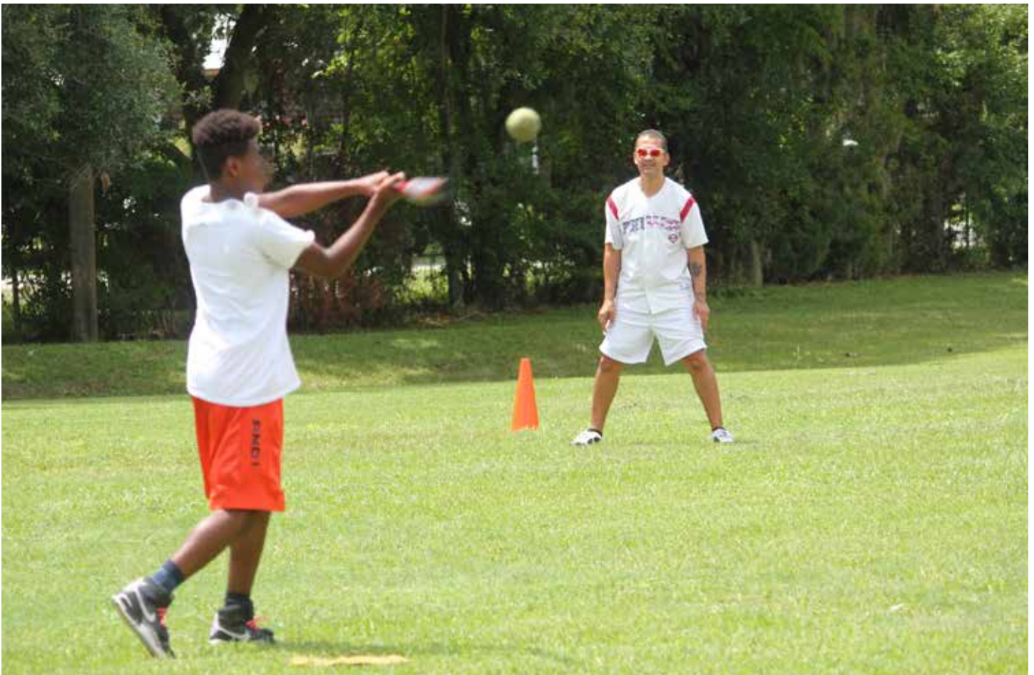
Social Skills improve with TFM

Through the support of her house parents, therapist and other staff, and their application of the TFM, she has greatly improved. She has become much more outgoing and sociable of the past few months, and now looks for opportunities to help