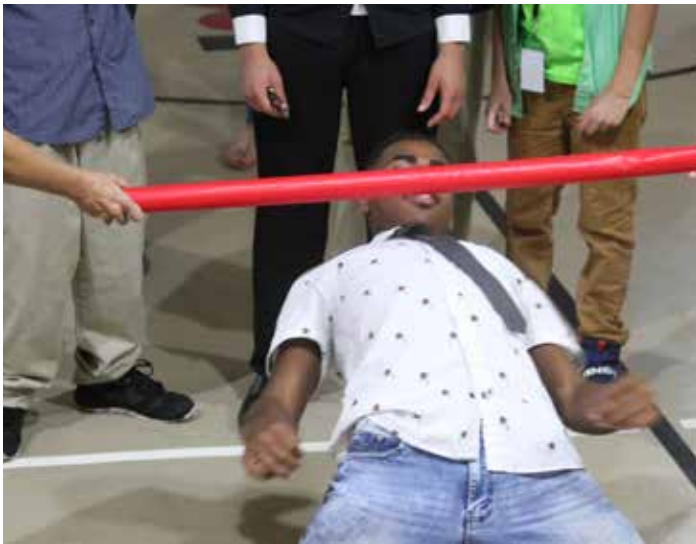
One of our youth showing his limbo skills at Homecoming