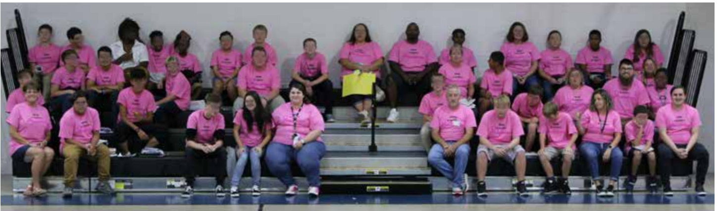
Students and staff wearing pink in support of breast cancer awareness