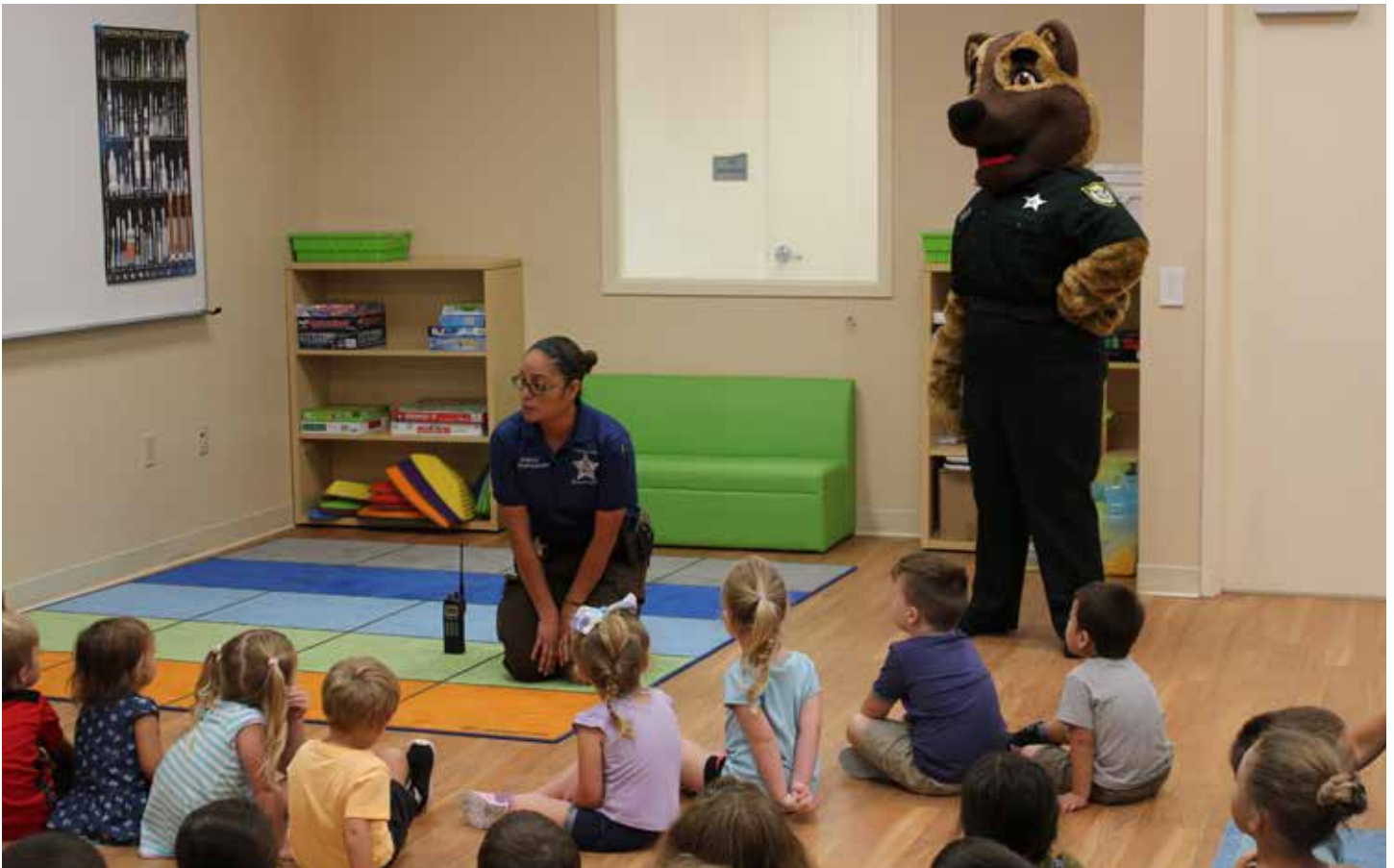
Children at In As Much Montessori learn about safety from Volusia County Sheriff's Officehole