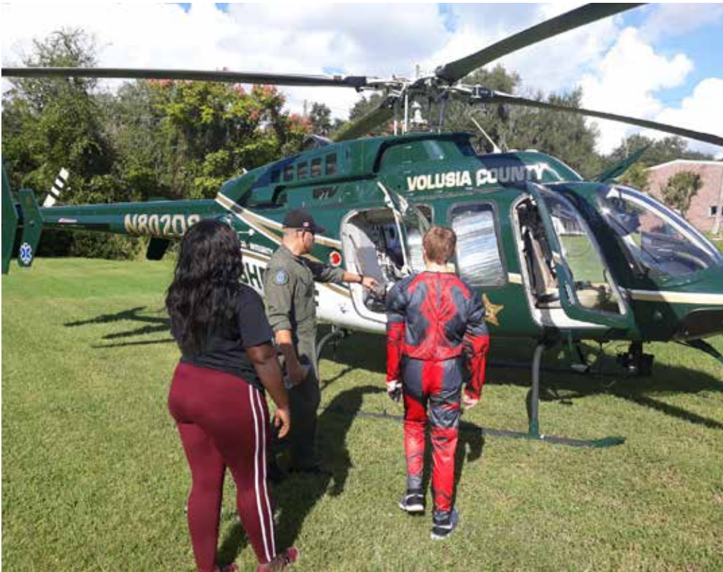
Volusia County Sheriff's Office brought their helicopter out to show the children