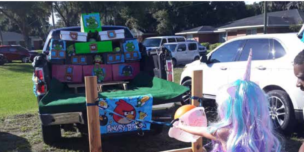
A little Angry Birds action