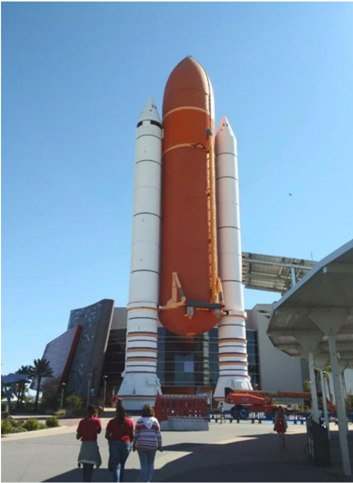
Some of our youth visiting Kennedy Space Center