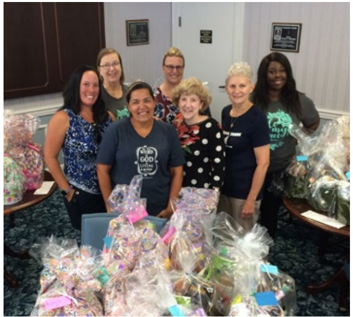
Volunteers from Life Song Church assembled Easter baskets for the children