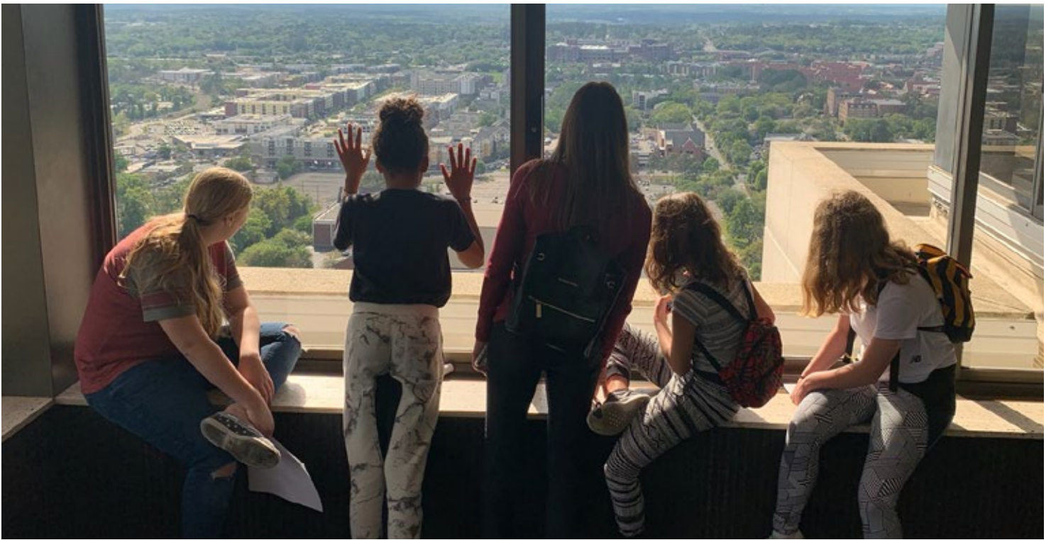
Some of our youth on a field trip in the State Capital Building in Tallahassee