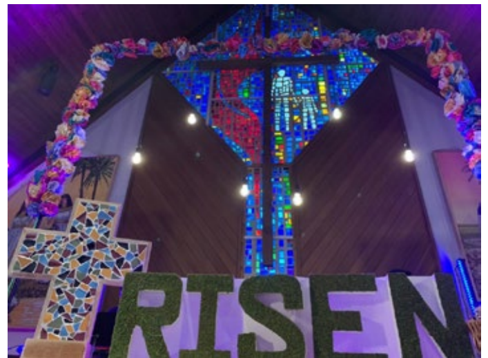
The Enterprise Chapel decorated for Easter