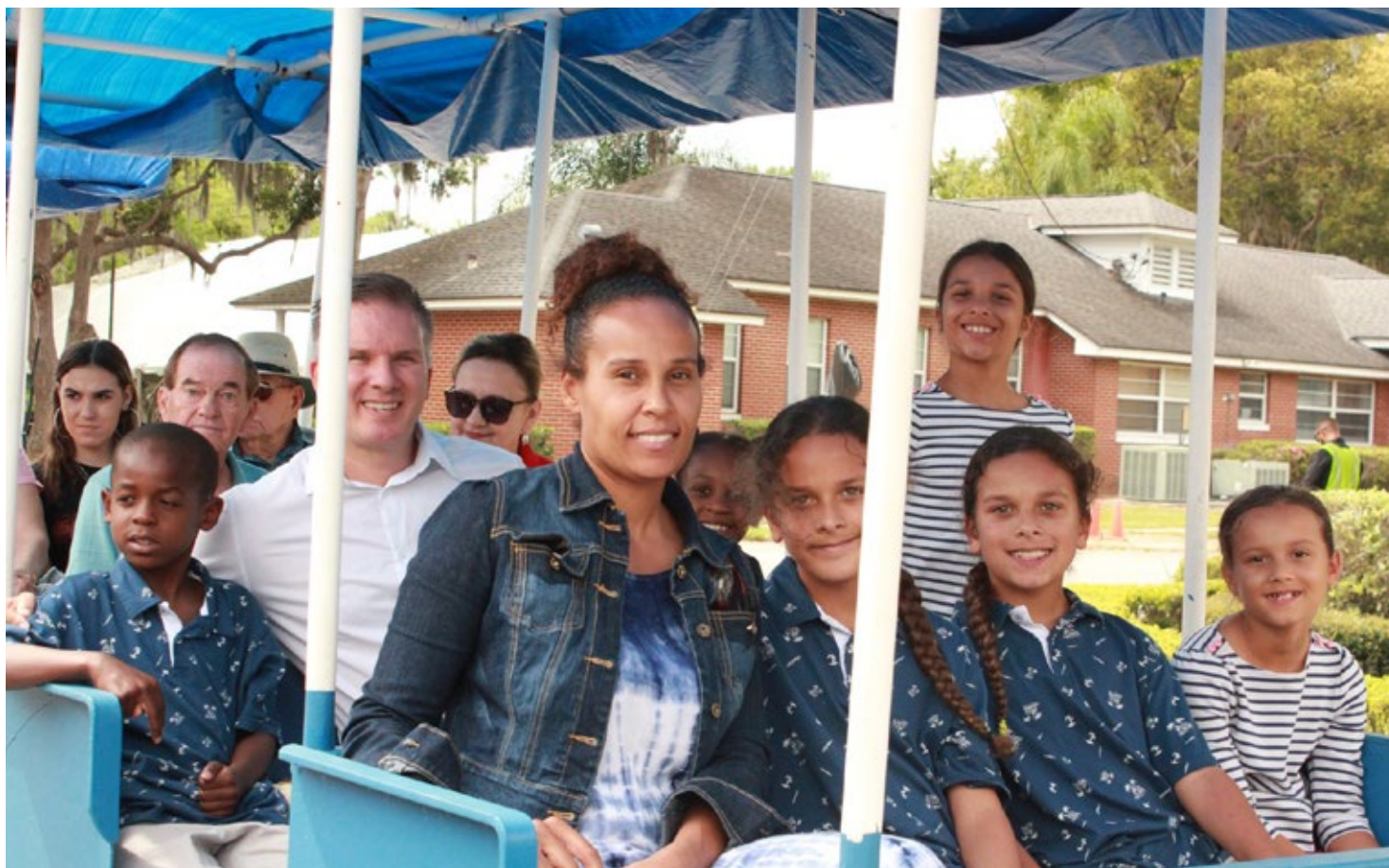
Enjoying a tour during Day On Campus