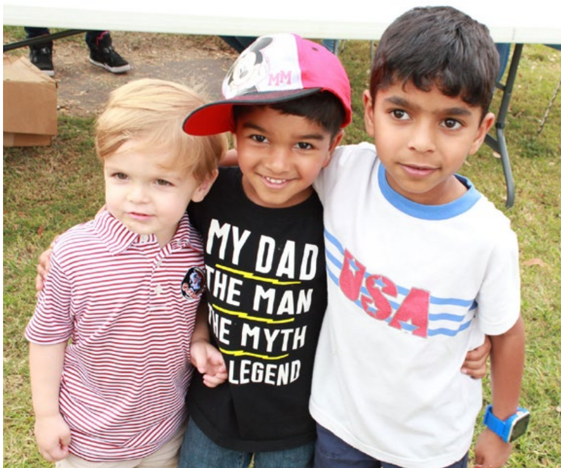
Day On Campus is fun for all ages