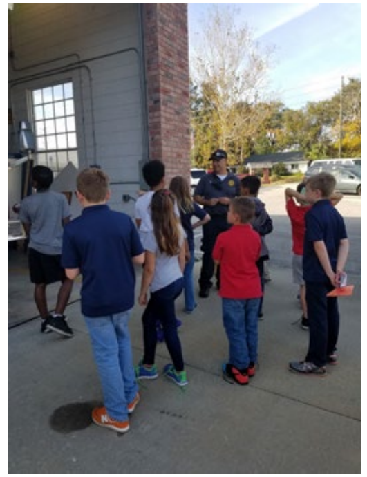
Some of our students on a field trip to a local fire station