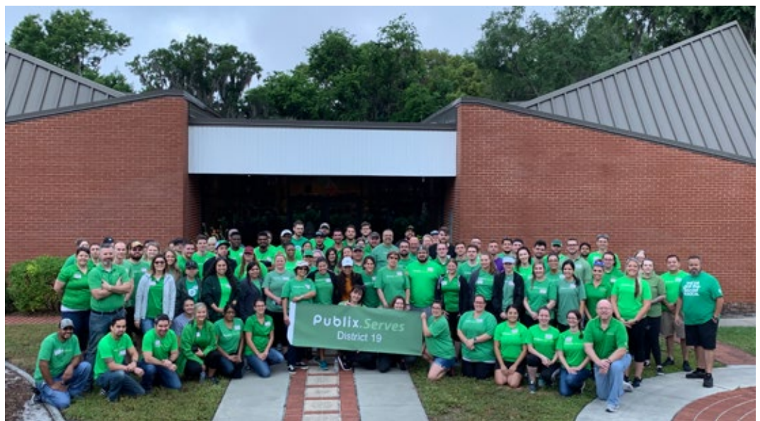
Volunteers from Publix came out for their Impact Day