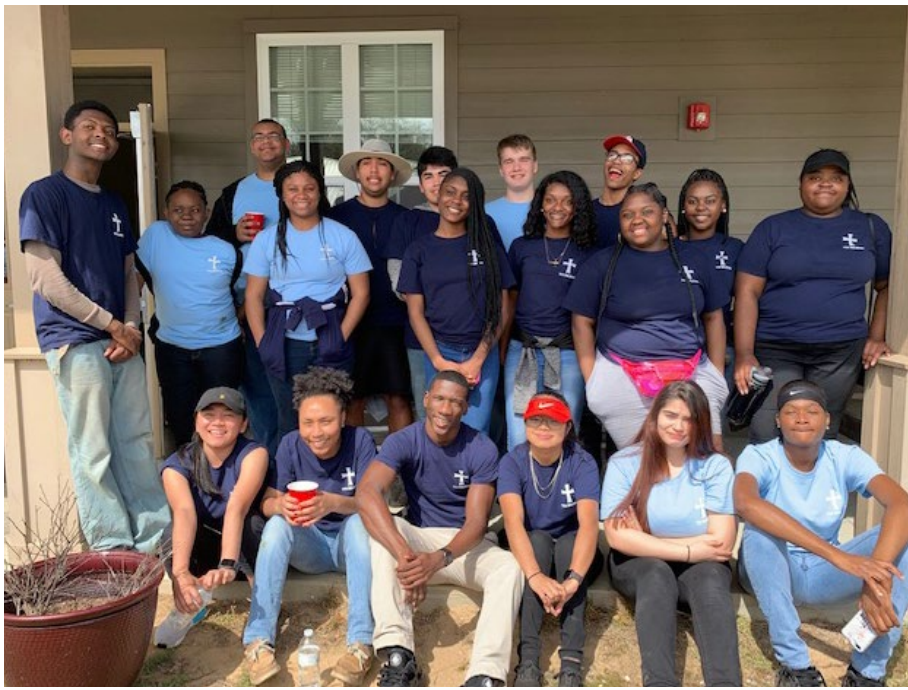
The Senior Class from Tallavana Christian School volunteers at Madison Youth Ranch