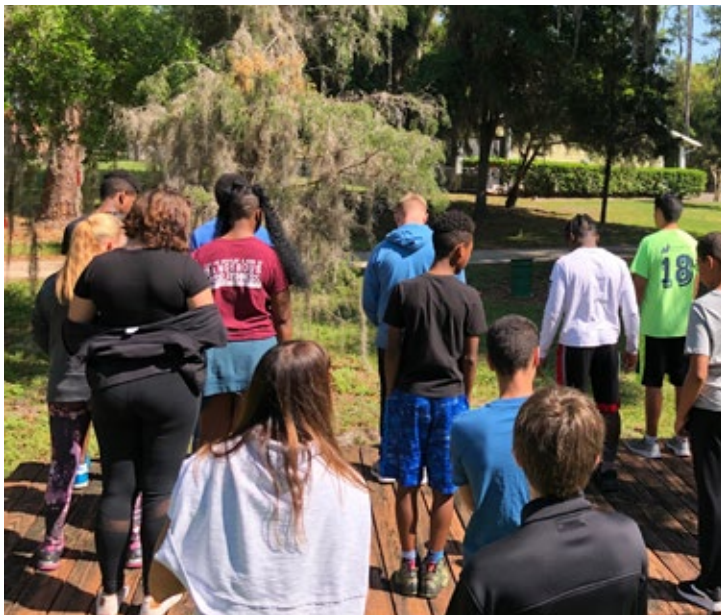
Youth participating in team building on our Enterprise ropes course