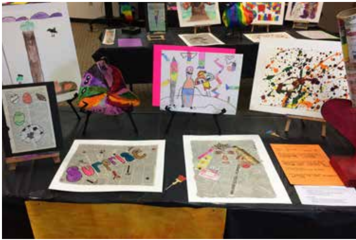
Legacy Scholars Academy students display their work during an art show