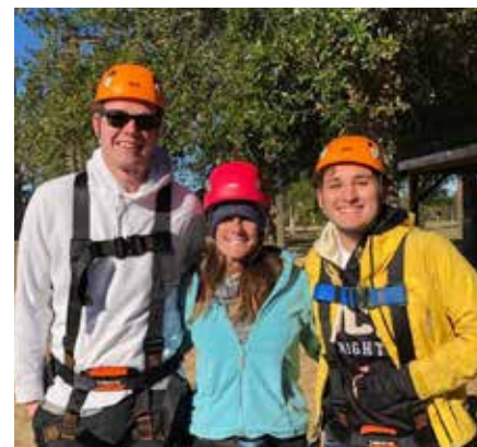
Our Recreation Department working on their Ropes Course Facilitator certifications