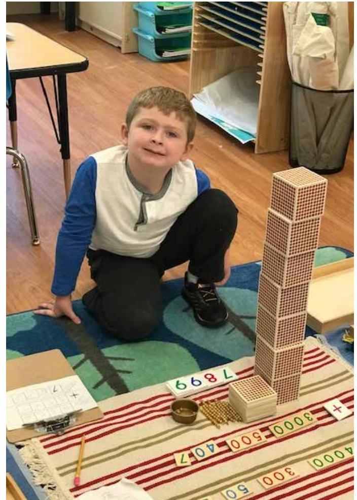
A student at In As Much constructing a math tower