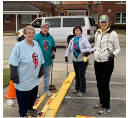
Volunteers from Cornerstone UMC in Naples spent a day painting curbs for us