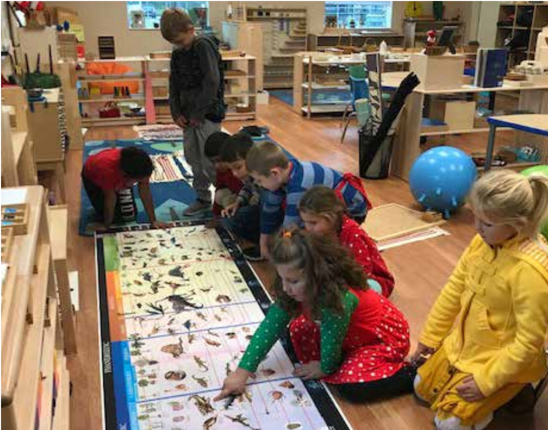
Children at In As Much studying the development of sea life