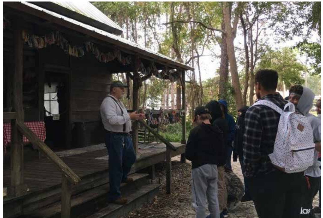
Students visit the Barberville Pioneer Settlement on a field trip